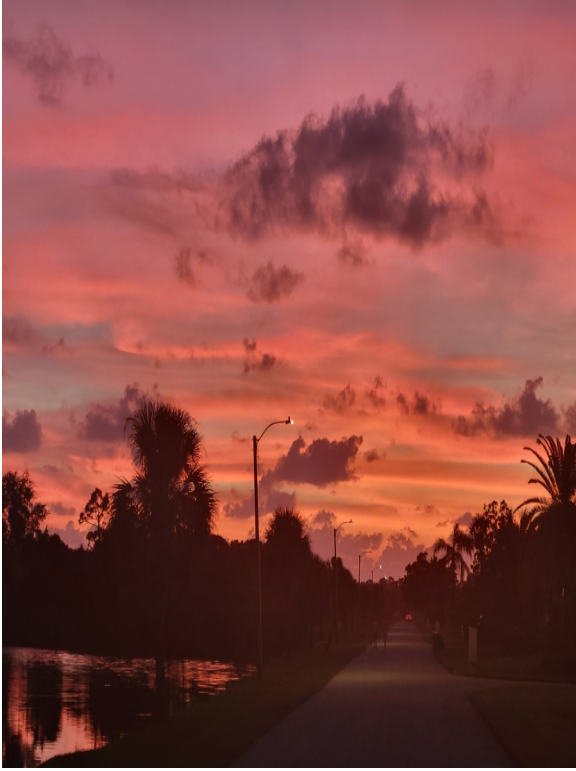
Sunset the day after Hurricane Helene