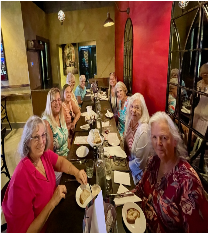
Ladies Luncheon - September